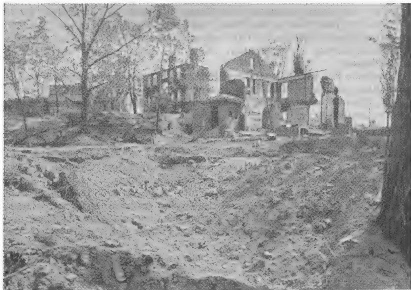
A church at Phyöngyang